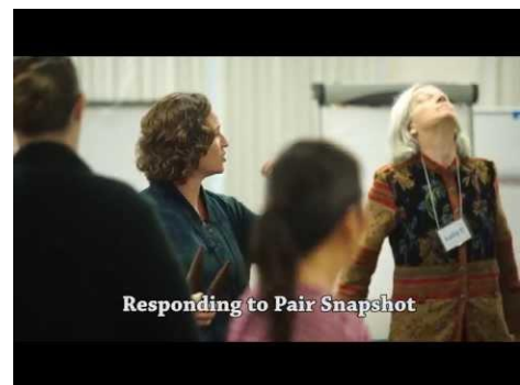
Responding to Pair Snapshot

(Click for strategy facilitation handout)